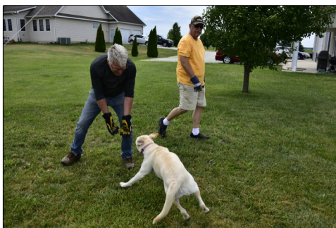
WR9L & NN9T with the KARS Field Day mascot at the N9OE FD QTH

August 1 W9ARH August 2 KA9MDJ August 4 K9RDK August 9 K9TP August 12 K9JMS August 22 KC9MZQ August 29 KB9OP August 29 N9ECM