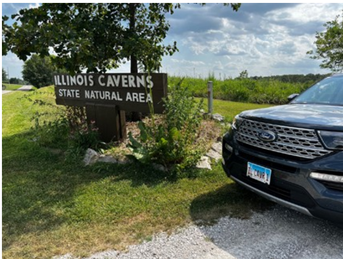
Above...The entrance to Illinois Caverns State Park Below...W9KVR's camp and operation site Bottom...Buddipole Antenna in front of IC Park Field House