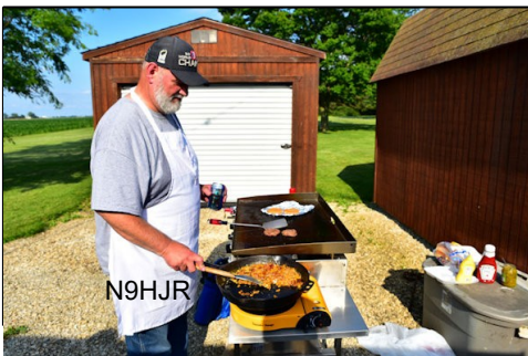
Field Day Dinner by N9HJR—Yum!