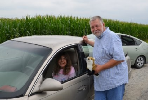
K9QT and N9IO

HU... =... ] bc ] g Wc f b | c f | F : KUN9RJM and N9RDH i b b Y 3