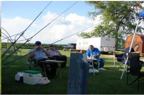
Hungry hams prepare to chow down. So much food, so little time. Everyone takes a break to enjoy the goodies from home

U b X ' K ] ' ' Ð g ' [ c c X ' W c c _ ] b [ "