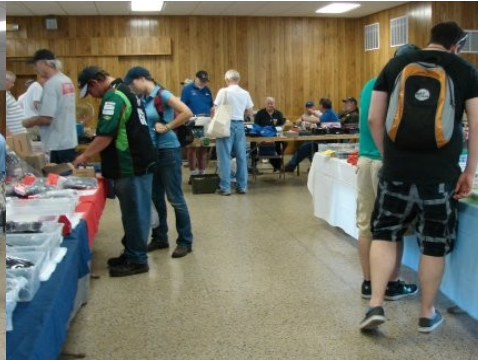
Inside vendors provide lots of goodies for air conditioned shopping