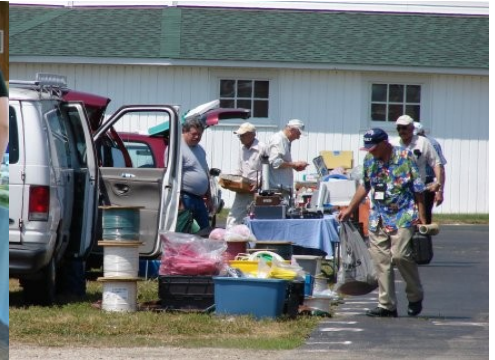
Walking through the flea market, hams find many bargains.