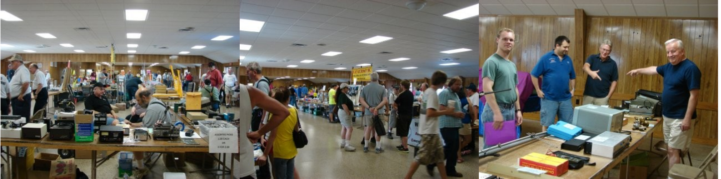
Two views at KARSFEST of inside vendors and an anxious crowd ready to peruse the goodies make their needed purchases