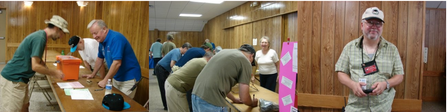
Examiners busy grading tests during Exam session at KARSFEST