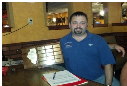
KARS wins traveling ILQP PLAQUE