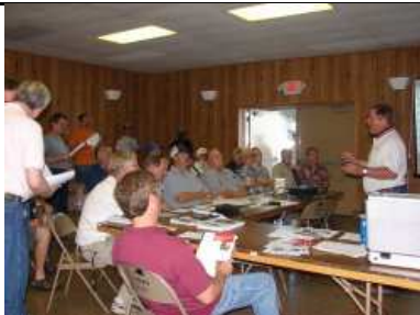
A standing room only crowd packed the D-Star session at the well received 2007 KARSFEST