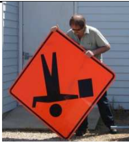
N9REG checks the men at work sign before work begins on his tower anchor