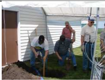
KC9GWF and KB9ZQU decide the hole is deep enough for the new anchor