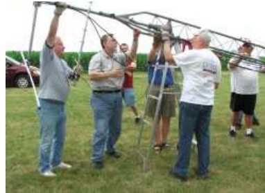
Everything that goes up must come down