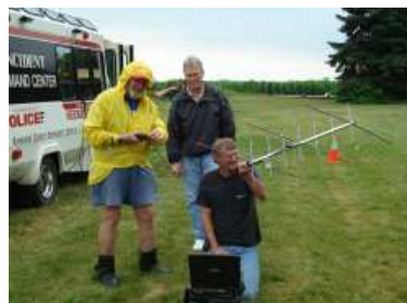
K9FO,WR9L, N9LYE search for the elusive satellite. It was here somewhere!