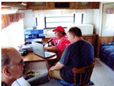
K9BIG and KC9DEP man the GOTA station while AK9F observes