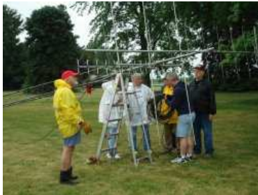
It's wet and rainy, but the tower must go up