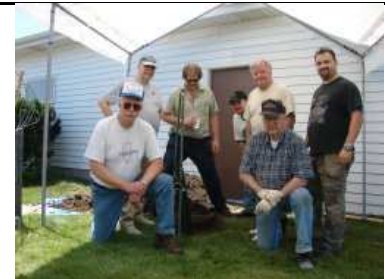
KARS members gather around the new anchor just in time for Field Day