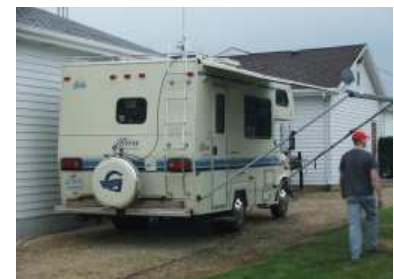
Jim N9FO's nice RV housed the 40 meter operating position