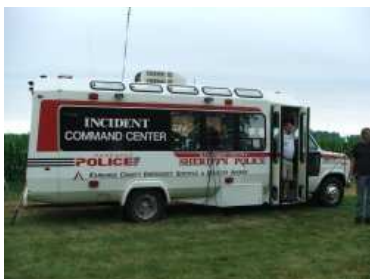
The County Incident command vehicle housed the 20,80, VHF and UHF stations