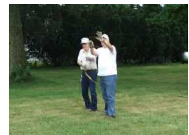
N9FO and K9CS scope out the alignment of the field day tower