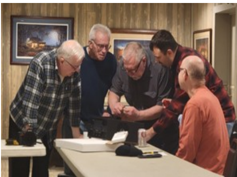
Members gather around K9NR's new Tuner Genius at the March KARS Meeting