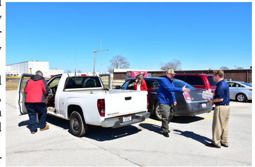
Arriving hunters greeted by the Fox N9FD