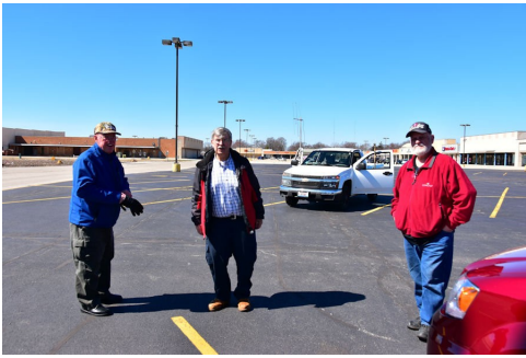
Ready at the start...KB9VR, N9DWE & N9HJR