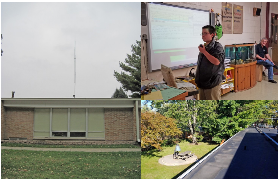
Top: KD9LBO at the controls Below: Cushcraft 20M-6M vertical

Awards: Regularly places in top 5 in SCR Middle School Division with National Championships in Oct. 2010 and Feb. 2011. Top Ten in ARRL CW Sweepstakes School Division and top 2 among non-collegiate schools in SSB Sweepstakes. They have had several high finishes in various state QSO parties. DXCC #44,725 (159 confirmed); WAS #54,198; Worked All States Triple Play Award #1944 (first non-collegiate school to earn this).