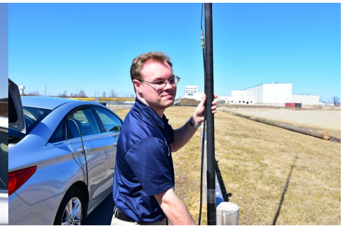
Fox N9FD folding up his 32ft mast