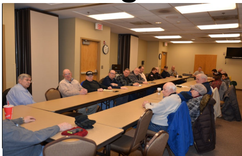
The March KARS general meeting followed by a program on storm spotting and severe weather