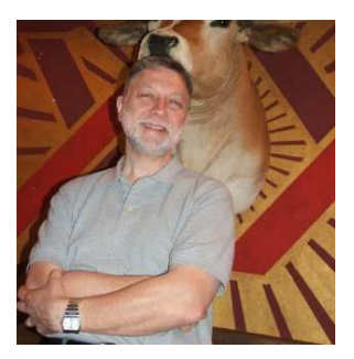
Clay, N9IO found out that all it takes is a cow, a salty scalp from a hot day at the Hamfest and you gotta Cowlick!