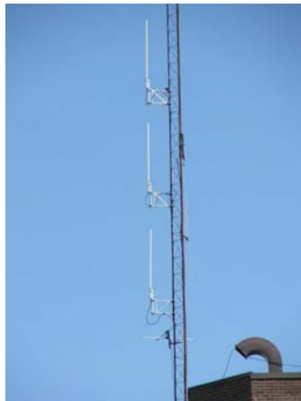
LEFT The three VHF/UHF ham antennas mounted high at St. Mary's Hospital