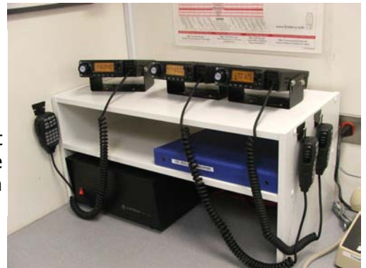
Right The operating position just off the emergency room