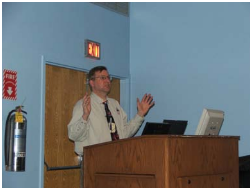
LEFT National Weather Service representative in action