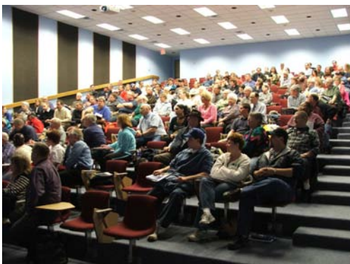
LEFT SRO crowd at the Severe Weather seminar at the KCC auditorium